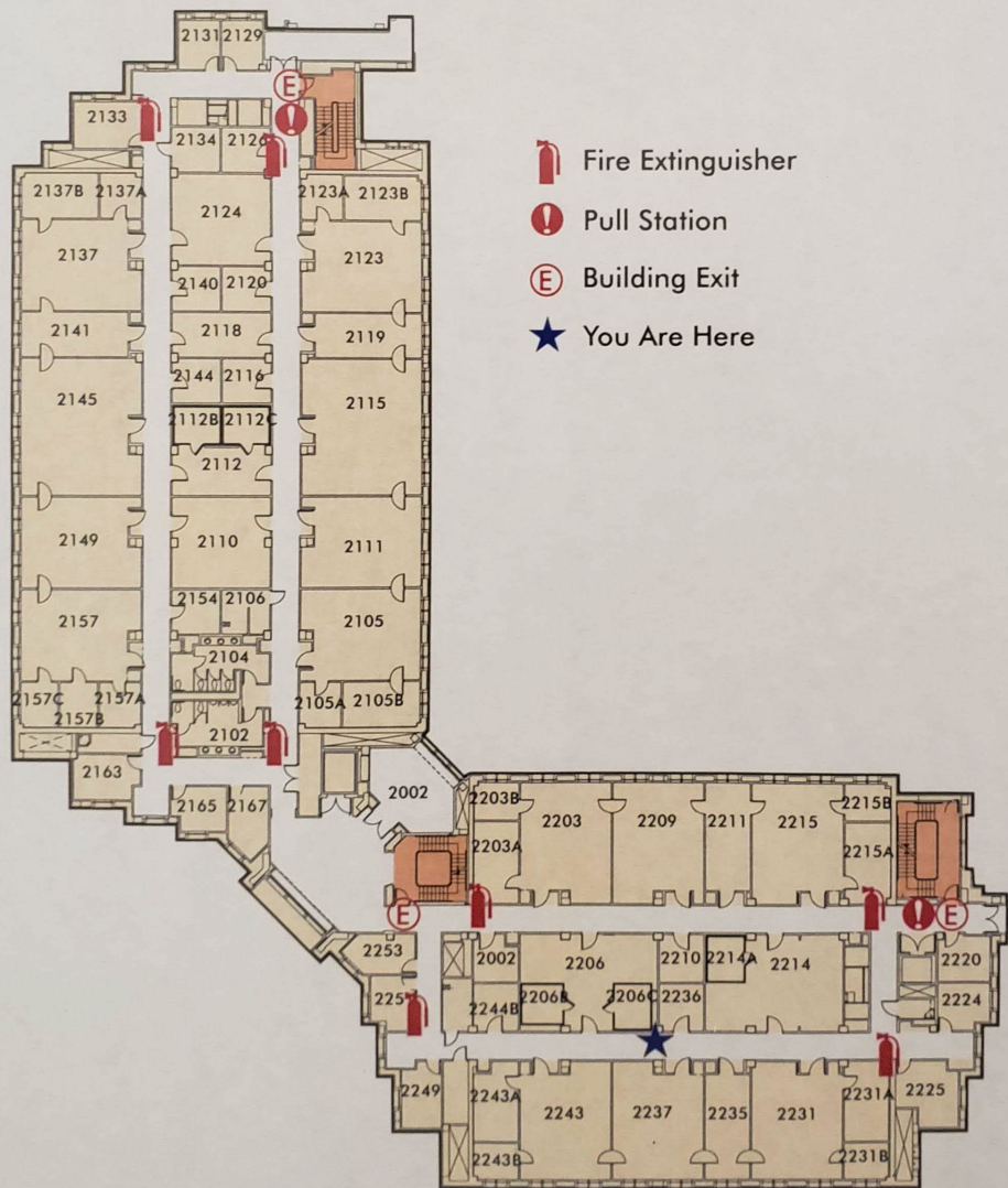
LIFE SCIENCES SECOND FLOOR