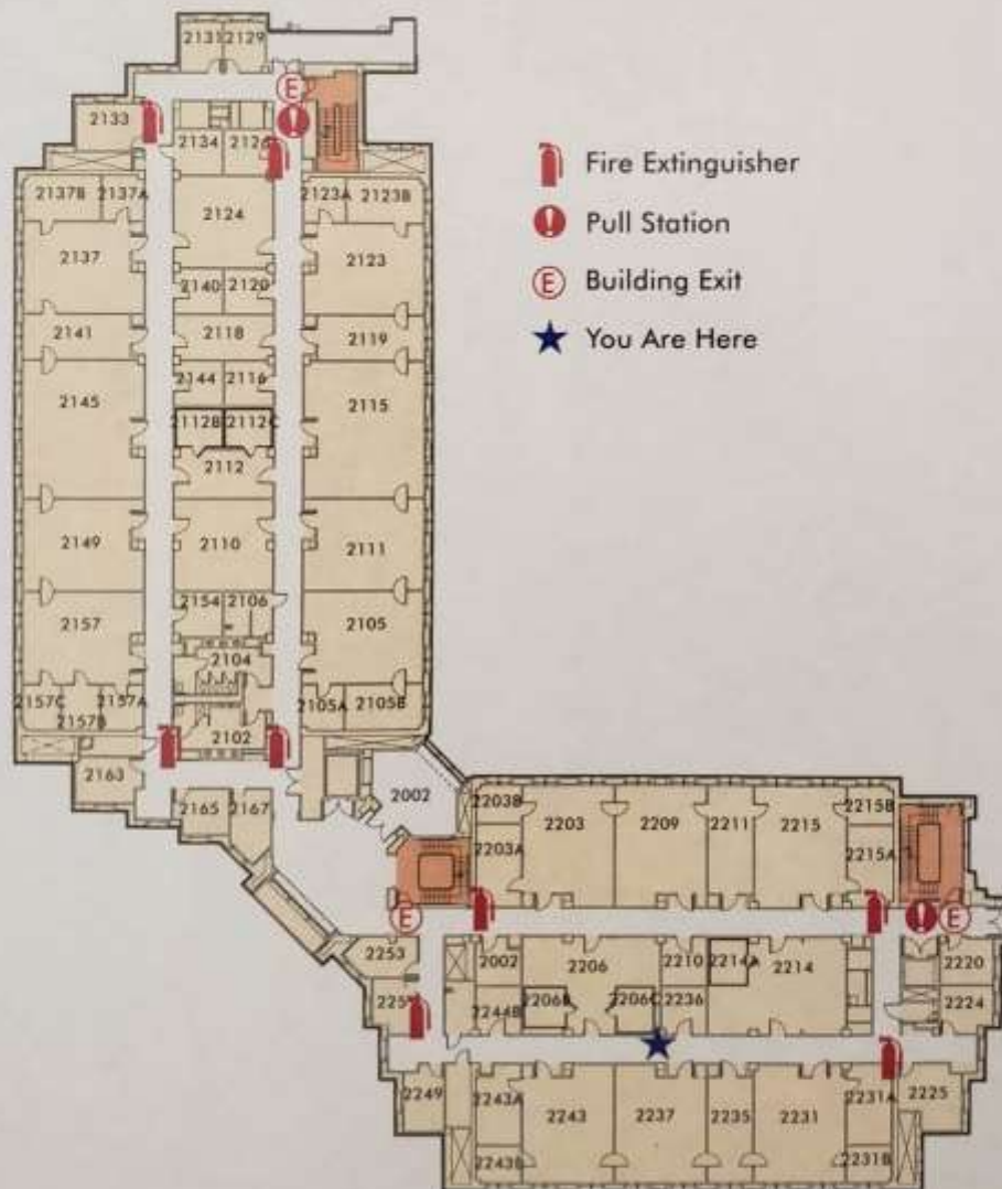
LIFE SCIENCES SECOND FLOOR